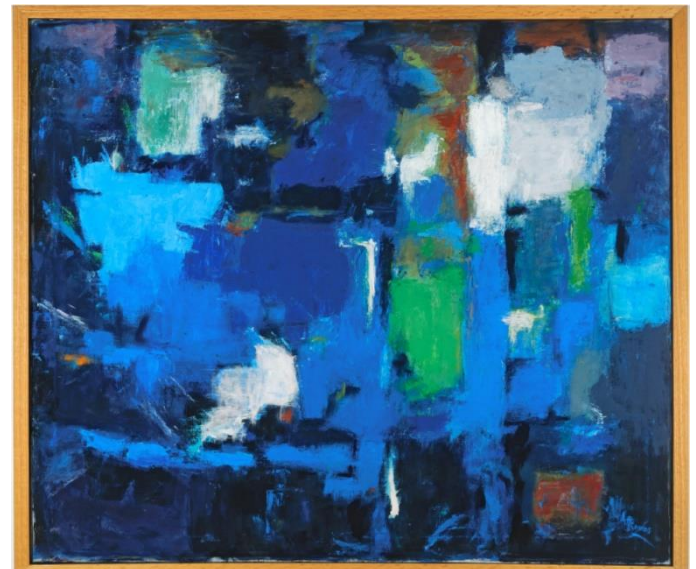
Alma Thoman. Blue Abstraction , 1961

The Gallery and University Art Committee continue to negotiate loans of art from the collection to major museums nationwide, bringing national attention to the masterworks of African American artists such as Aaron Douglas, David Driskell, Charles White, Alma Thomas and Edmonia Lewis. Partnerships have been made with the Museum of Modern Art, the Whitney Museum of American Art, the High Museum in Atlanta, the Phillips Collection in Washington, DC, and the Metropolitan Museum of Art, which plans to feature Edmonia Lewis’s sculpture Forever Free as a central element in an upcoming exhibit on slavery. Several of these institutions have agreed to offer internships to Howard University students interested in museum professions. These loans will bring welcomed national attention to masterworks in the University Art Collection.